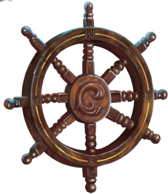
Handout #1: Captain Renlock's Wheel

TO FIND YOUR WAY, YOU MUST BE ABLE TO NAVIGATE BY THE SUN, THE MOON, AND THE STARS, PRAYING UPON A LUCKY COMET TO FIND YOUR WAY HOME.